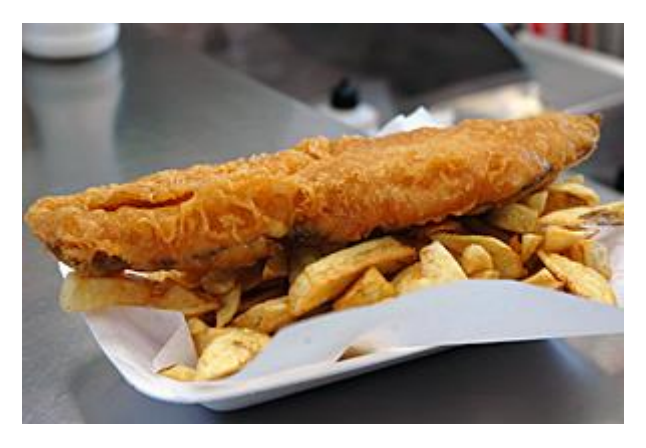
Fish and chips for those with a taste for drama

The Mikron Theatre Company is touring the country till the end of October with a play entitled One of Each. It's a tale of storms at sea, saucy secrets and sibling rivalry centred on two chippies seeking a gong.